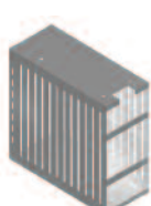
Secure CPU Holder