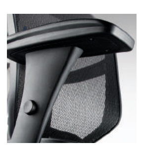
Build your own unique Project Enjoy chair using a combination of mesh, fabric and leather finishes at comfort.global/create